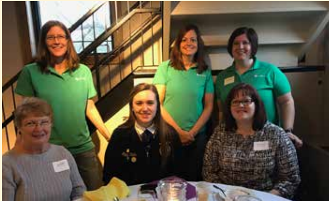
Fremont ladies with their members.