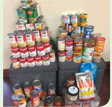
Van Wert's canned food donation