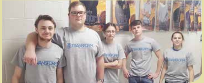
Liberty Benton FFA