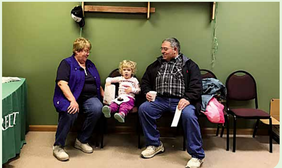
Sharing snacks at Upper Sandusky's open house