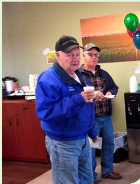
Van Wert members enjoy refreshments