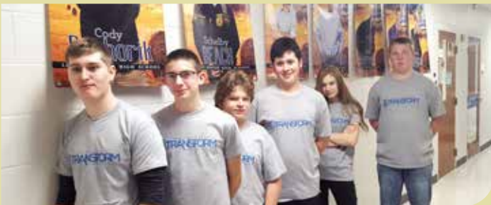
Liberty Benton FFA