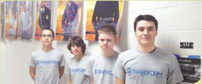
Liberty Benton FFA