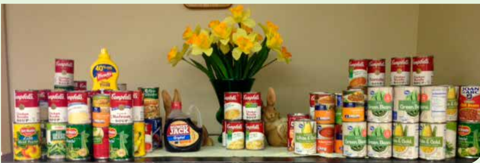
Marion's canned food donation