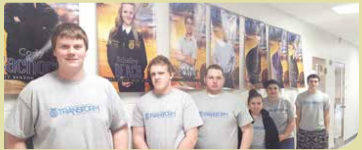
Liberty Benton FFA