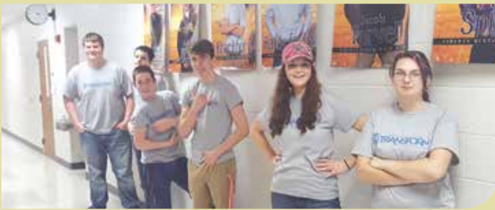
Liberty Benton FFA