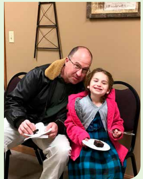
Enjoying refreshments at Upper Sandusky's patronage open house