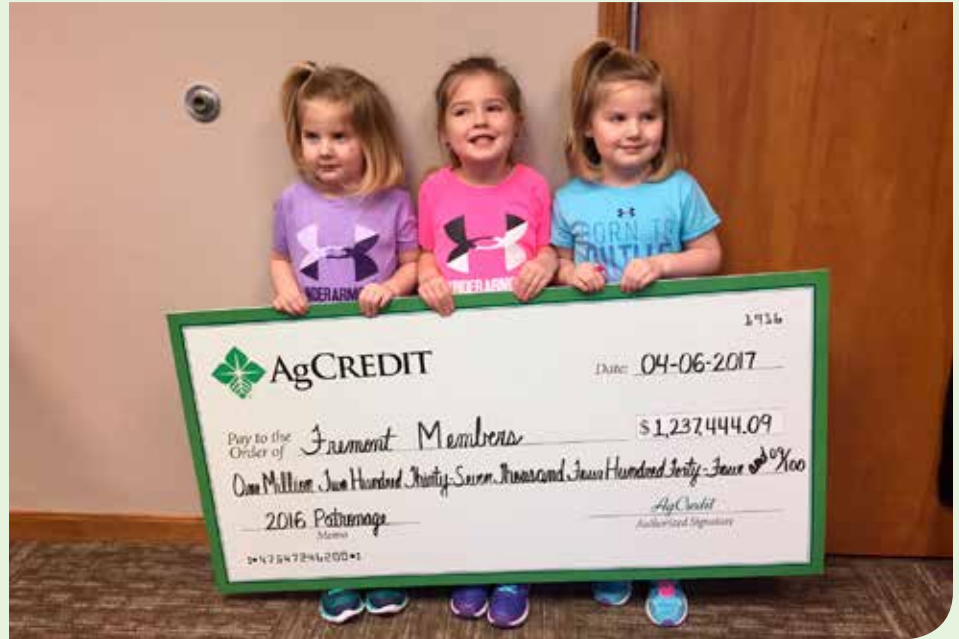
The Martikan girls show off the big check