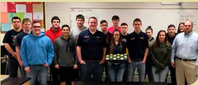
Oak Harbor FFA